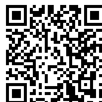
Submit Scoring Inquiry

NOTICE: When submitting a protest, request or report, the procedure (as set forth in the Racing Rules of Sailing and the Sailing Instructions) remains unchanged.